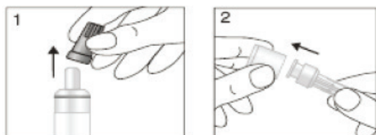
Fig. 1: Pull the rubber stopper off the easy-to-use syringe

Handling instruction for the ready-to-use syringes: